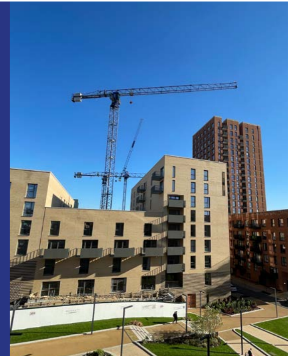
Image: Block J4 and J5 (left), Tower Crane 10 (immediate background)