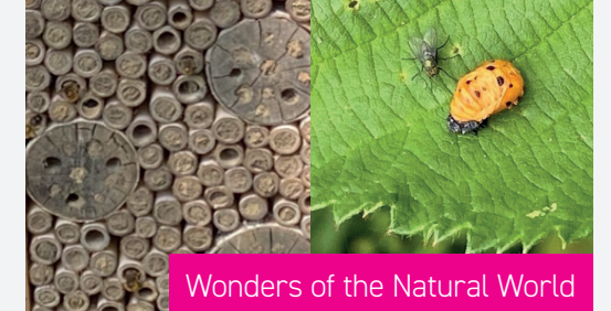
Wonders of the Natural World