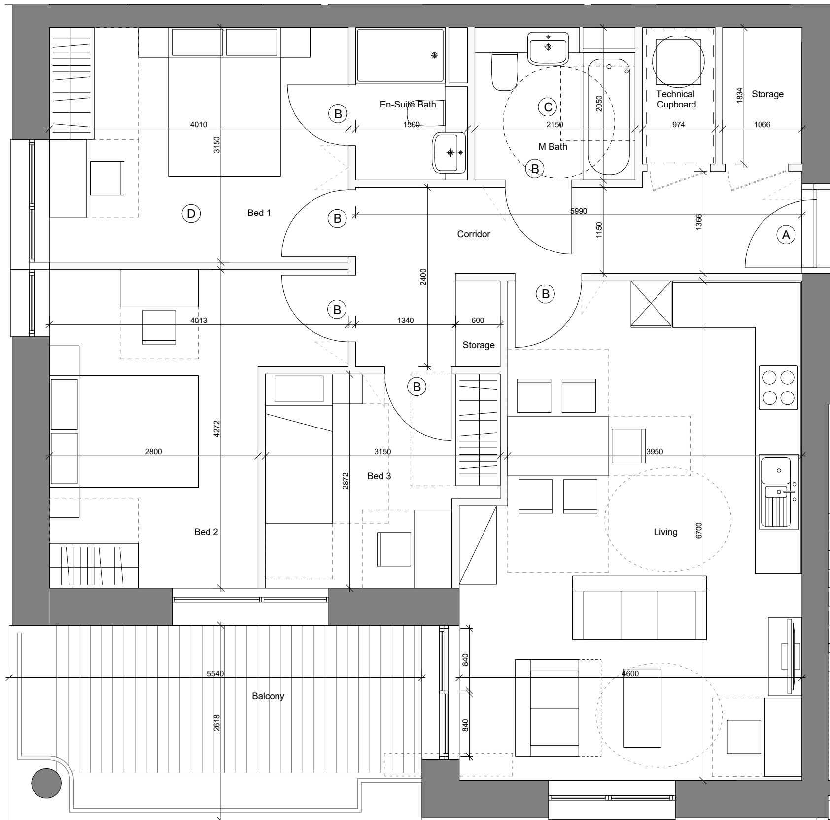
01 First Floor 3B-5P-02