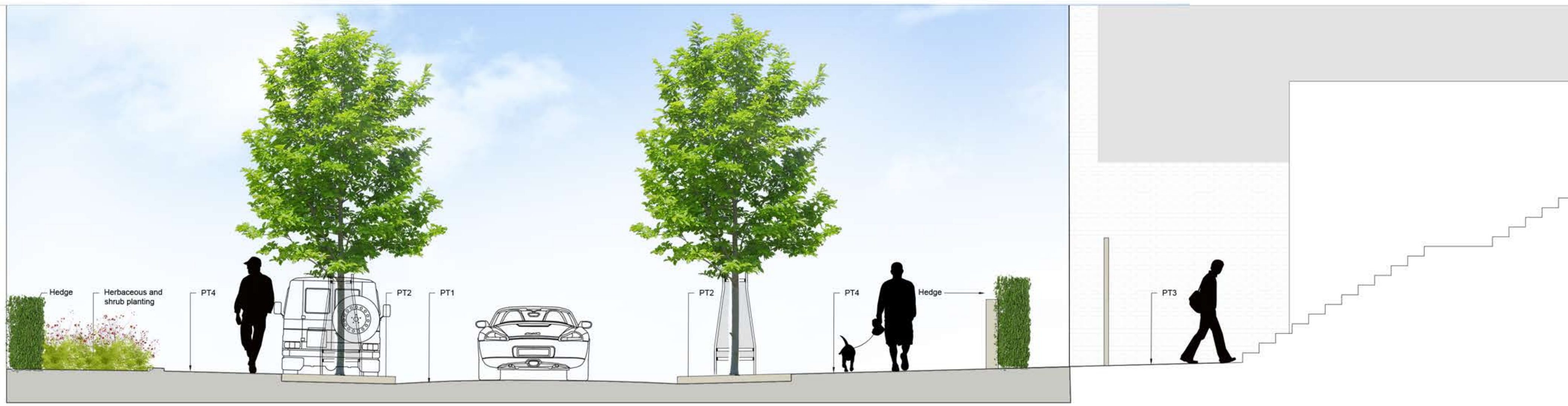
1 500 Section Trough West Street scale 1:50@A1