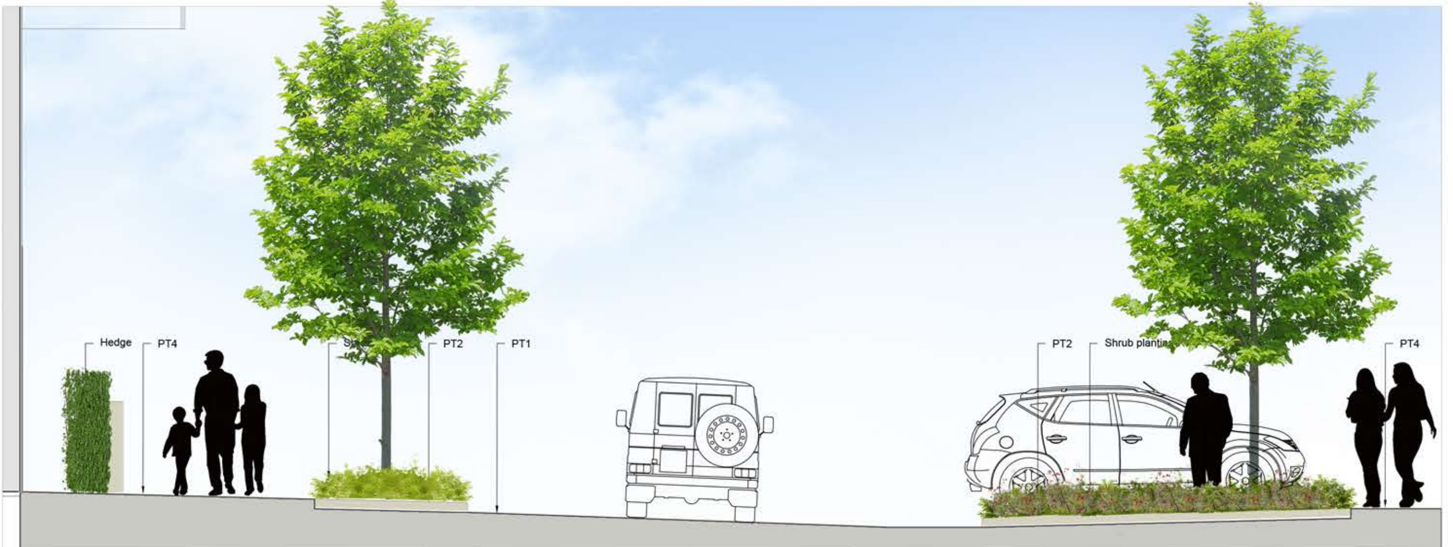
3 500 Section Through East Street scale 1:50@A1