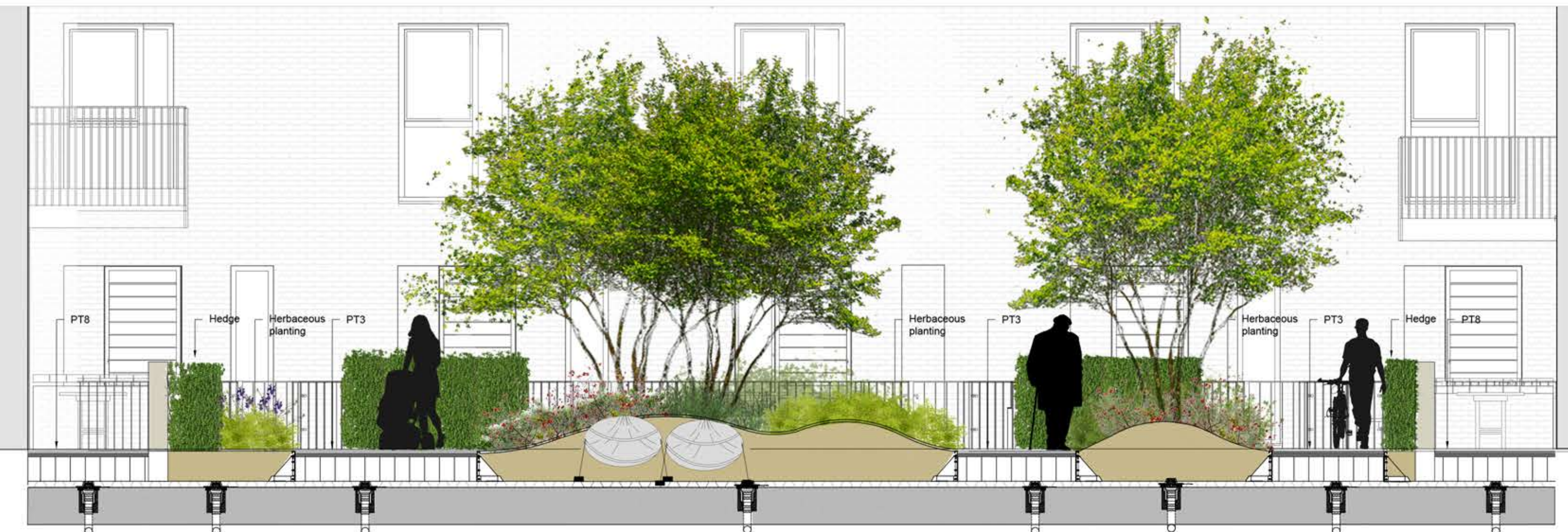
2 500 Section Through Internal Podium Garden scale 1:50@A1