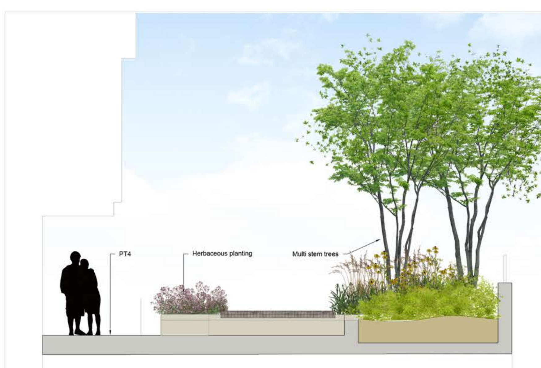
5 500 Typical Section at Block H2 Podium scale 1:50@A1