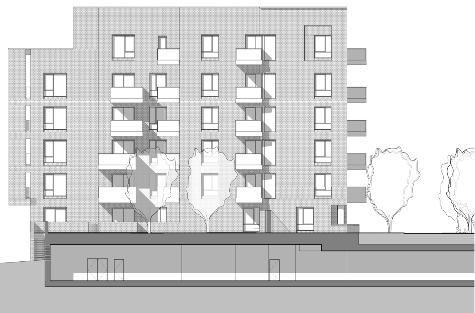
1 South East - K1 1 : 200