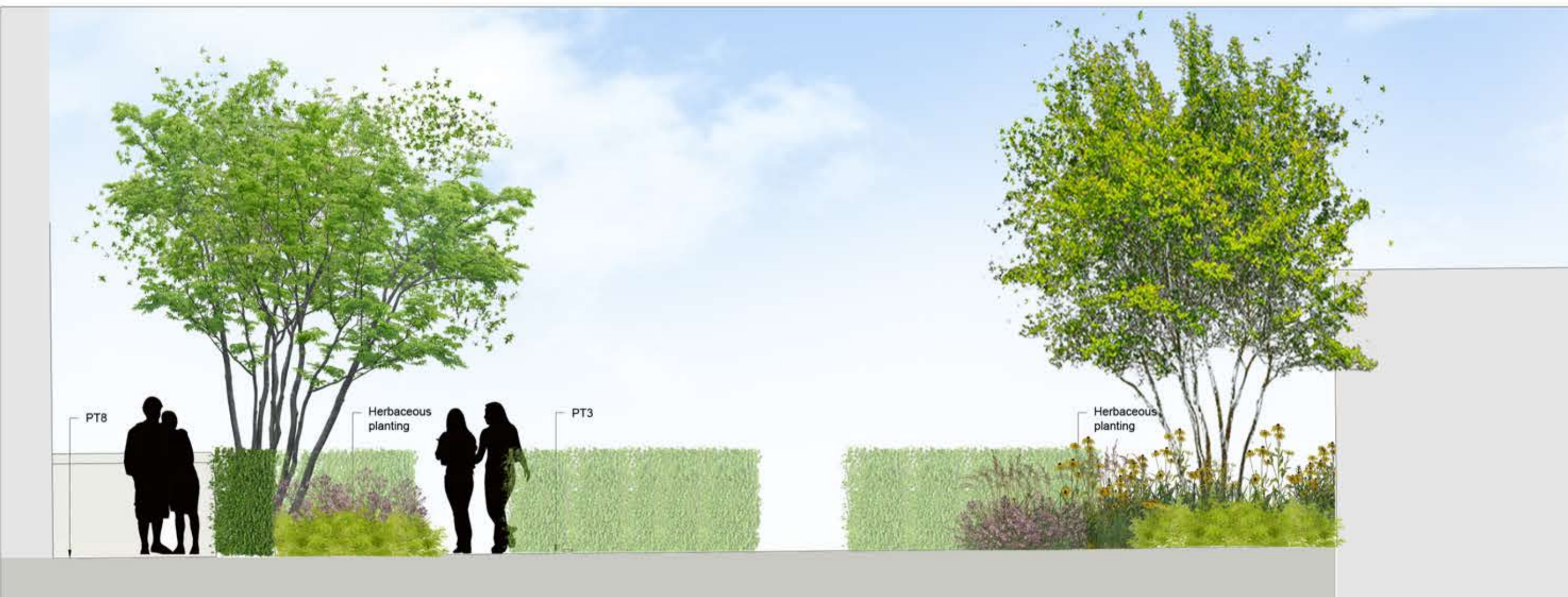
2 501 Section 7 - Through Block H1 Podium scale 1:50@A1