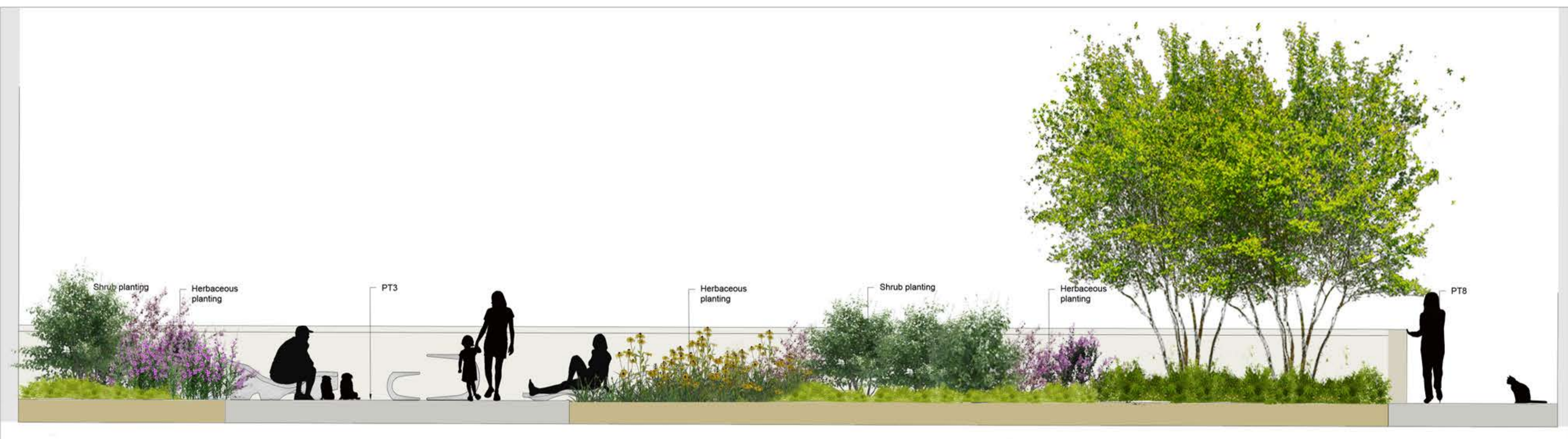
3 501 Section 8 - Through Block K Podium scale 1:50@A1