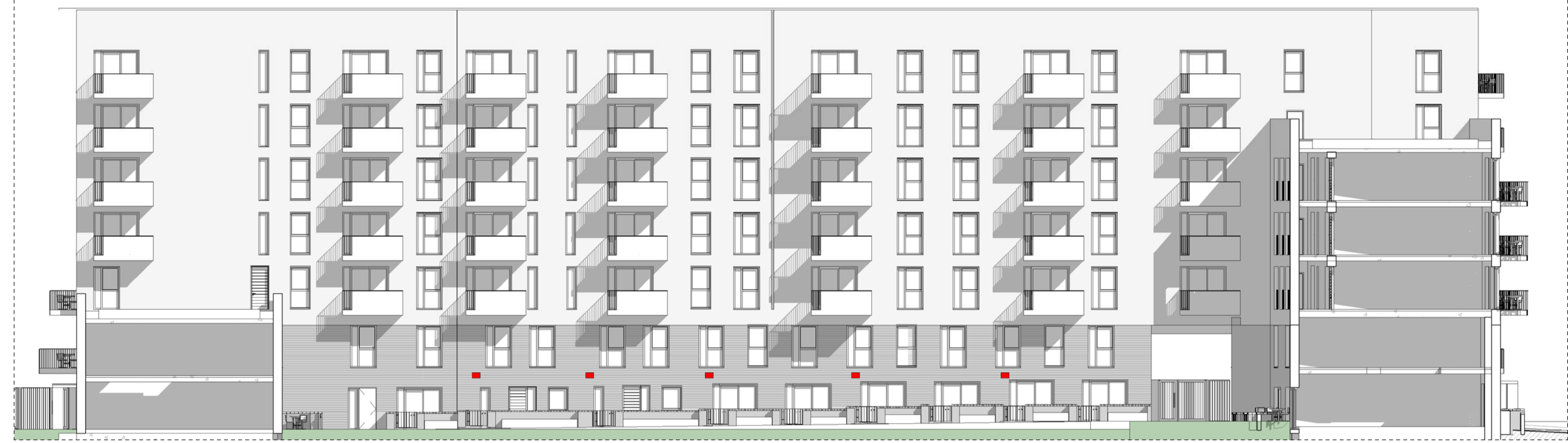
2 202_A_South West Internal Elevation_House Sparrow Bricks 1 : 200