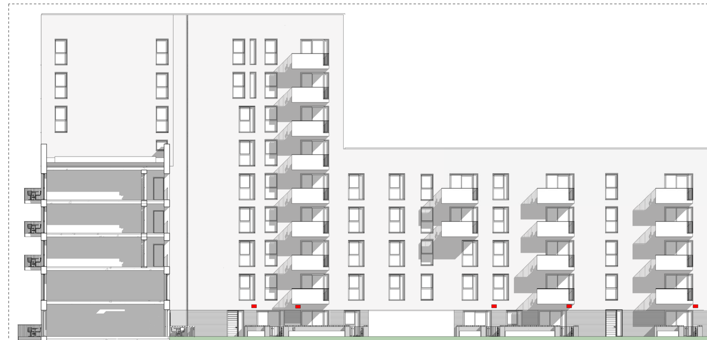
3 202_B_North East Internal Elevation_Shadows_House Sparrow Bricks 1 : 200