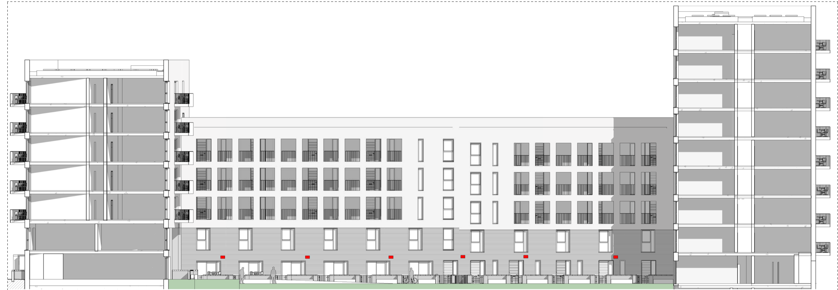
4 204_B_North West Internal Elevation b I_House Sparrow Bricks 1 : 200