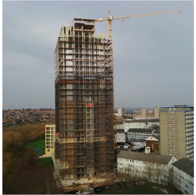
E2 has topped out

Temporary pedestrian routes are being constructed to provide access to the car park whilst we undertake these works. The routes will be marked using barriers and signs. Any landscaping or railings that are removed as part of these works will be replaced after the sewer diversion work is finished.