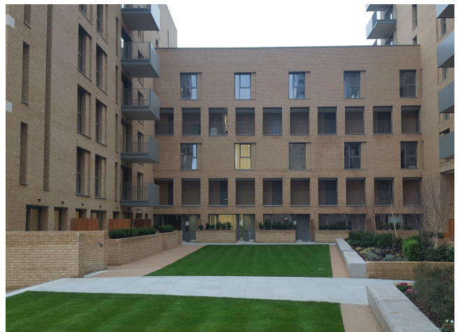
Greenshank House and Dunnock House